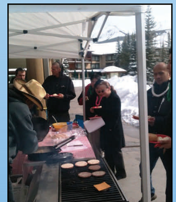
Welcome Spring Community BBQ